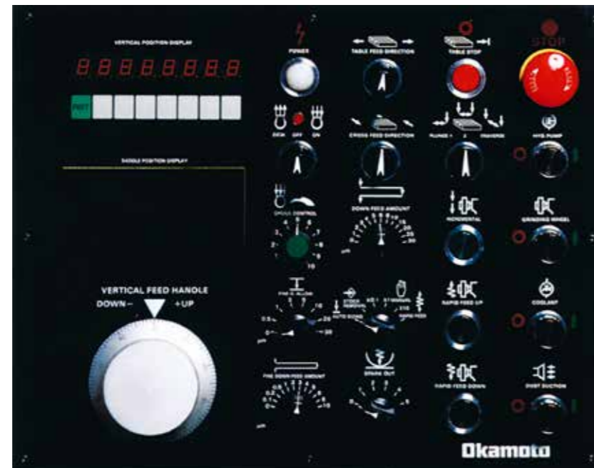
Okamoto control panel