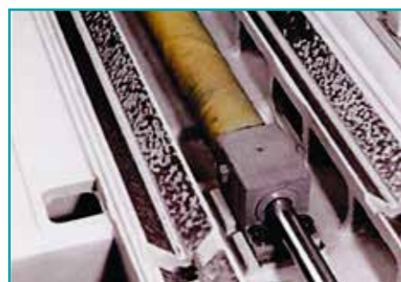
Hand scraped slideways