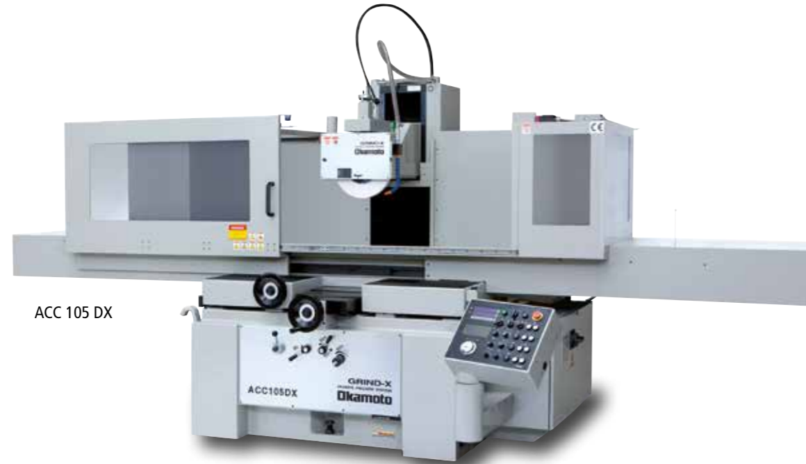
ACC 105 DX